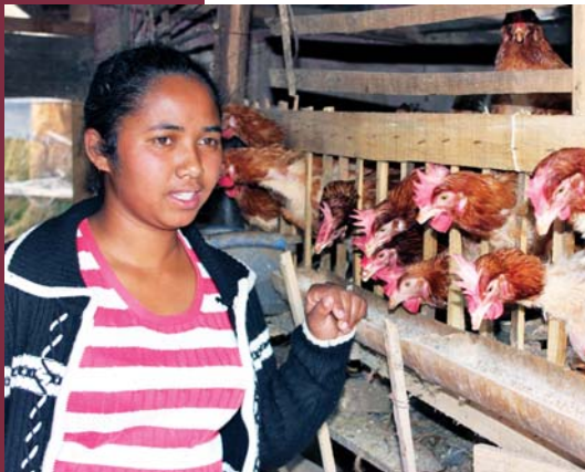
Beneficiary of the project "Women and entrepreneurship", urban commune of Manjakandriana.