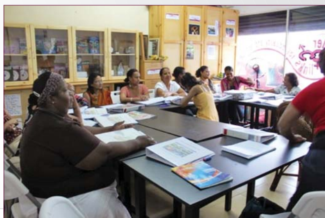
Empowering women: ending violence - Back stopping training session with women entrepreneurs in the GL office.