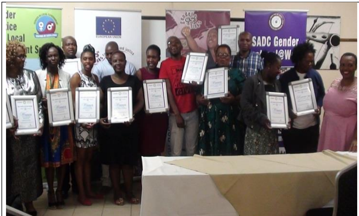
Award winners and Runner ups at the 2016 Lesotho Gender Summit