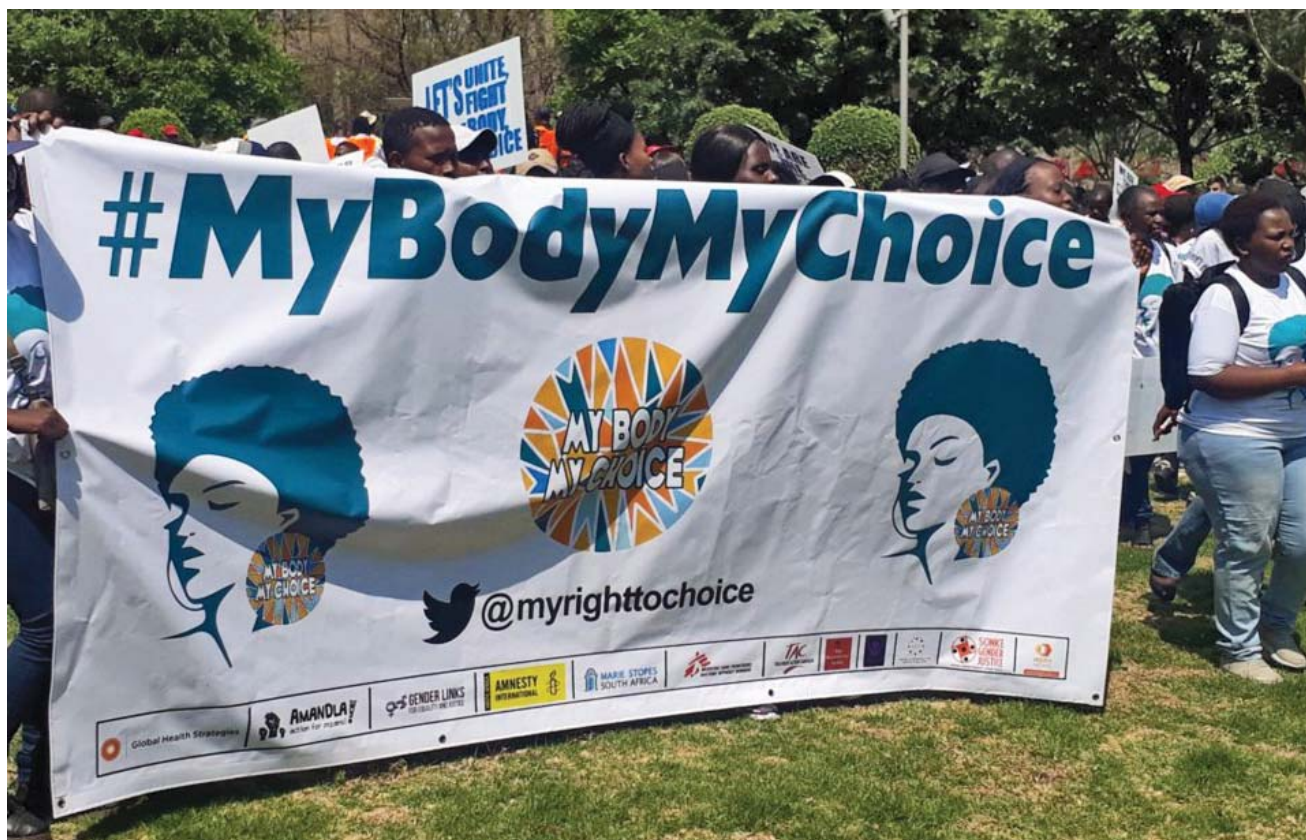
My Body, My Choice march in Johannesburg, South Africa, on International Day for Safe Abortion held annually on 28 September.

the MMR varies between 4% in Botswana and 14.1% in Zambia (though there are differing estimates, some higher).