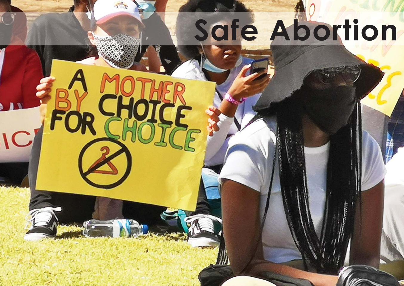
Showing support for the right to choose in Namibia.