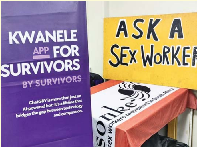
ChatGBV is a chatbot simplifying access to information, resources, and assistance for GBV survivors navigating the justice system.

chatbot is currently in beta mode for additional testing and growth, with full deployment planned for the middle of 2025.