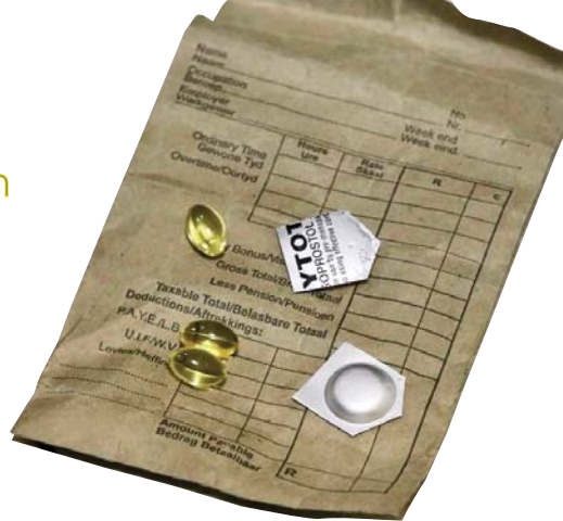
Abortion Pills, the common name medical abortion using mifepristone and misoprostol to end a pregnancy.

WHO emphasises that all individuals engaging in self-management of medical abortion need