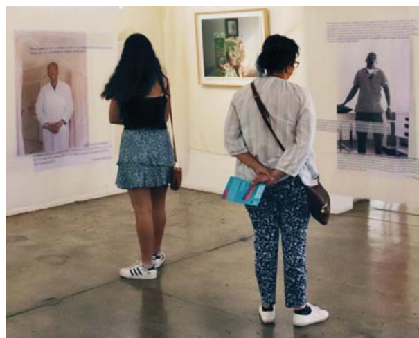
My body, my choice art display in South Africa.

Most countries provide some access to post abortion care