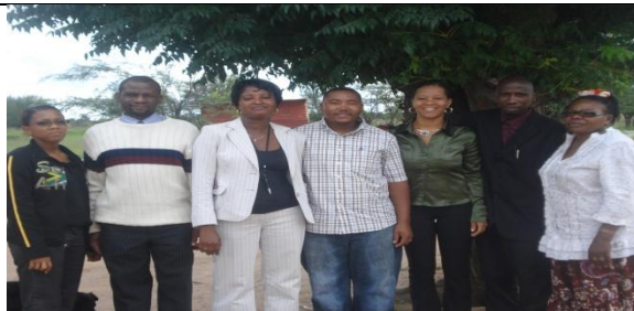
New Councilors:Witvlei Village Council