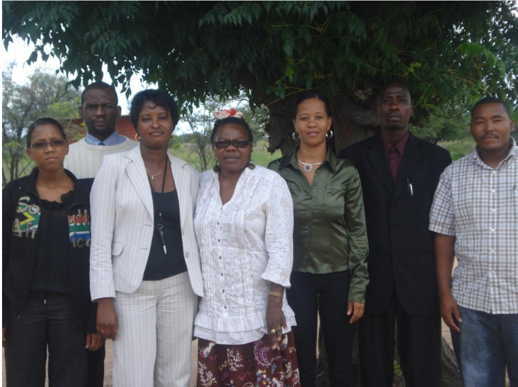
Group photo with New Councillors of Witvlei Village Council.