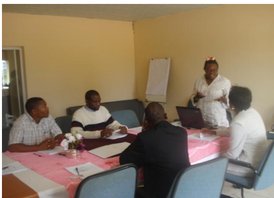
SXE addressing New Councilors at Witvlei Village

The Witvlei Village Council is one such Council who has completed all seven stages of COE. The workshop, stage 5 was the only remaining stage to zeal the historic chapter of completion of the COE. When the news was brought to the new Council, it was happiness. They thanked GL and team