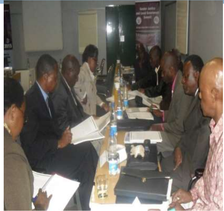
Gender Action Planning workshop