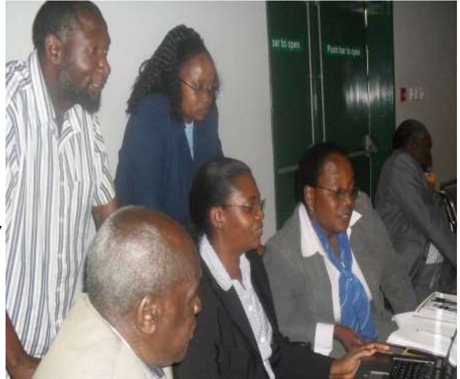
PARTICIPANTS DEVELOPING GAP