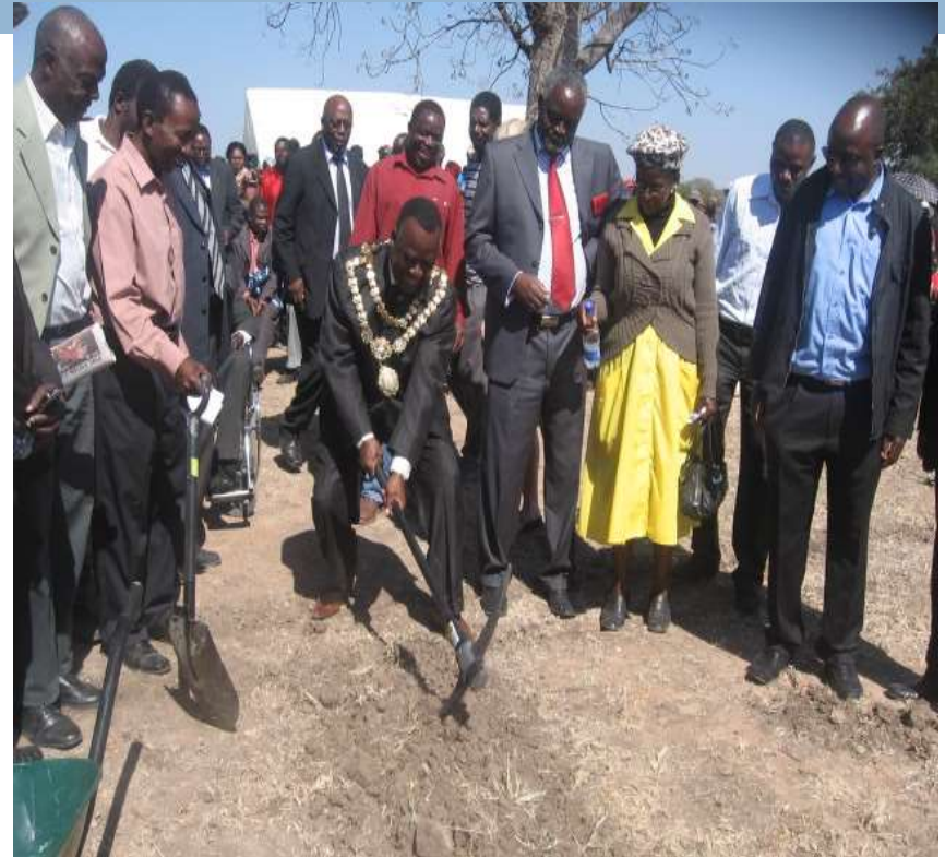
Mazwi Housing Project, Ground Breaking Ceremony