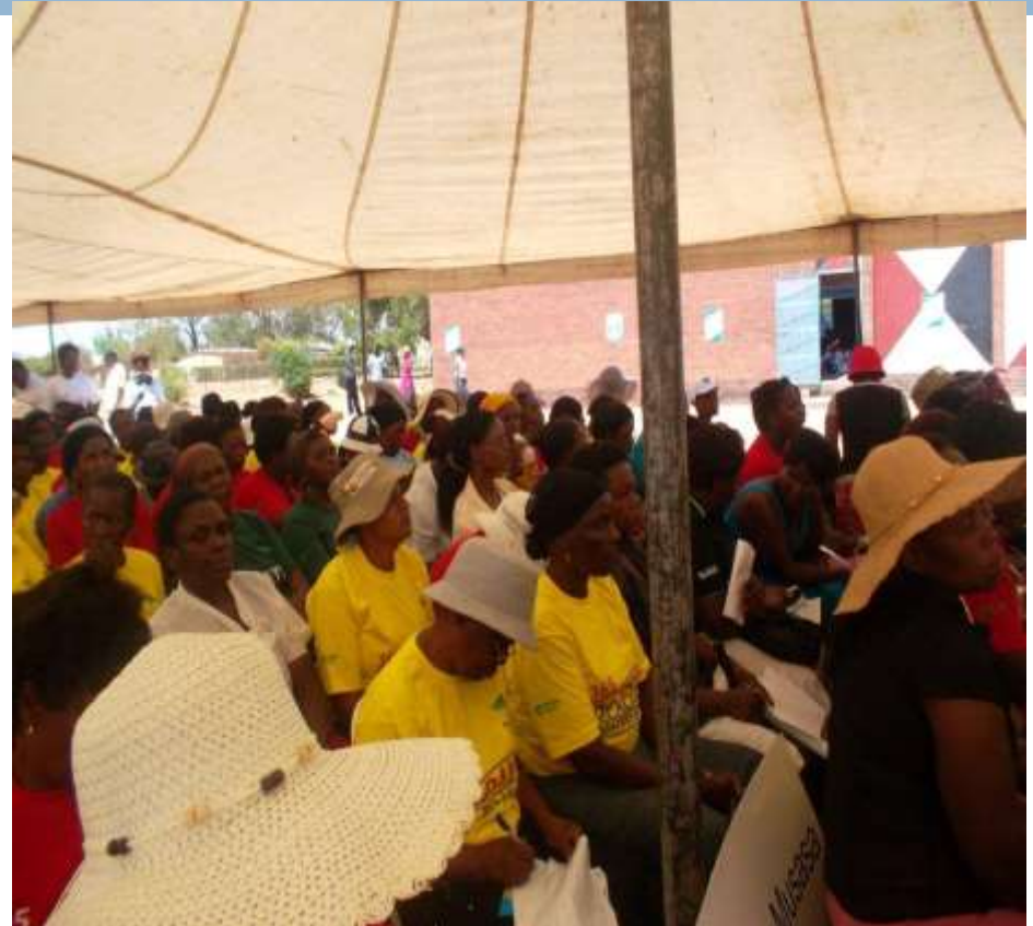
Launch of Sixteen Days of Activism against Gender Violence