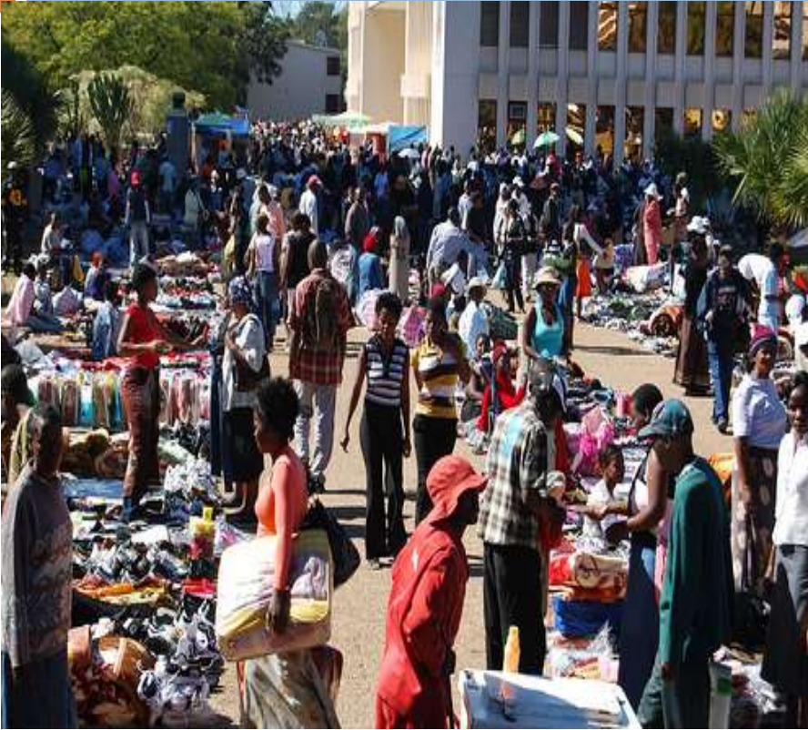
Local Economic Development