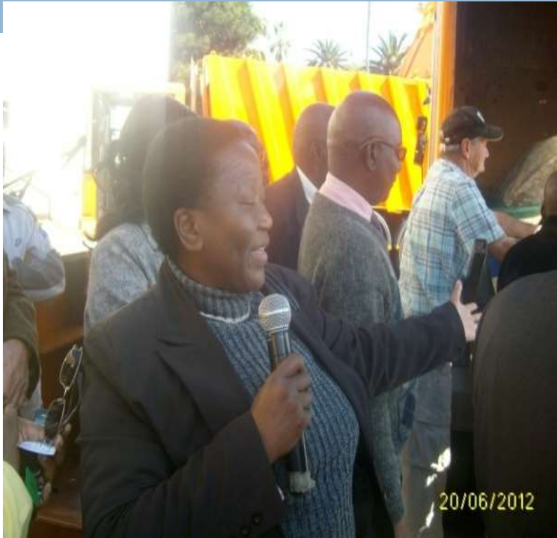
Director of Health Services