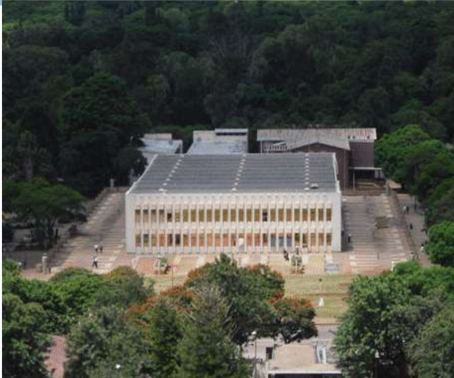
City of Bulawayo Revenue Hall