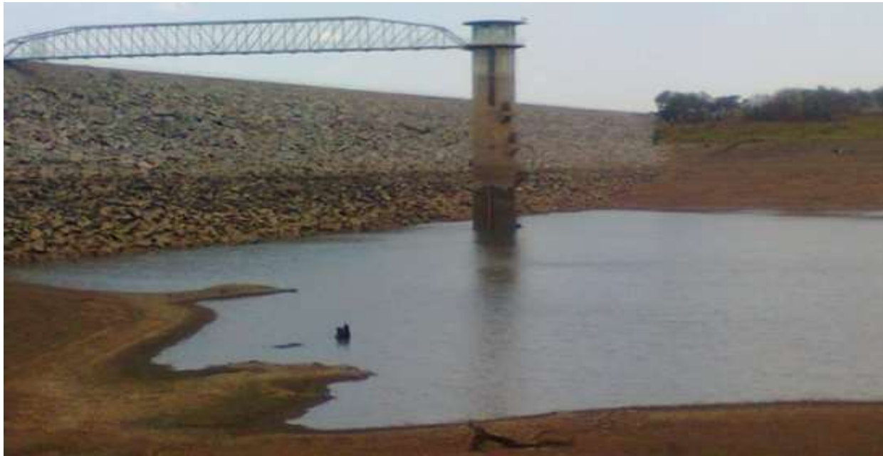
Crisis ... Umzingwane Dam before the onset of the rainy season