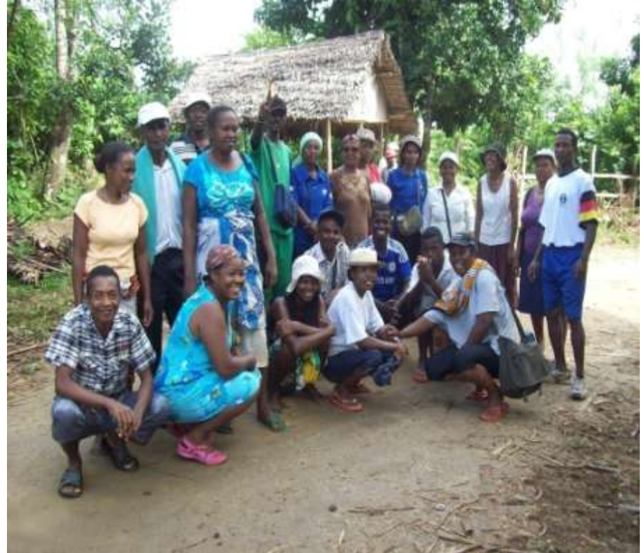
Members of the association during meeting at the council