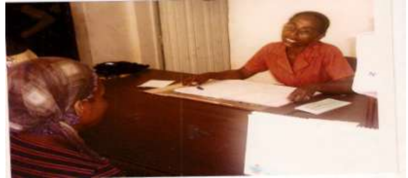
A woman coming to the centre for complaining