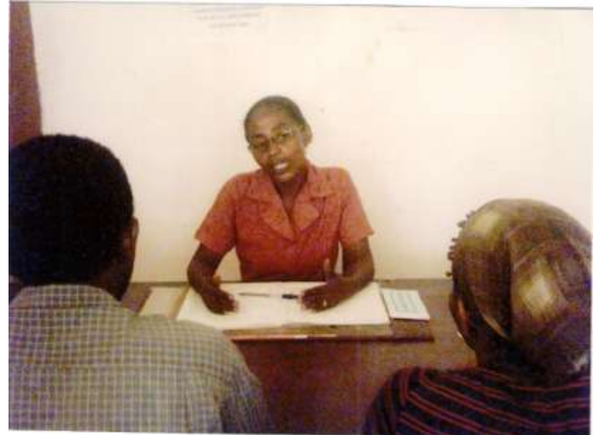
Conflict resolution, case of a couple