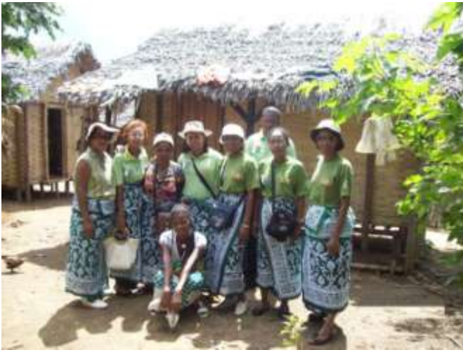
Members of an association of women in the council