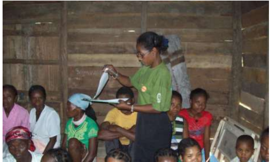
Session of sensitization in the council