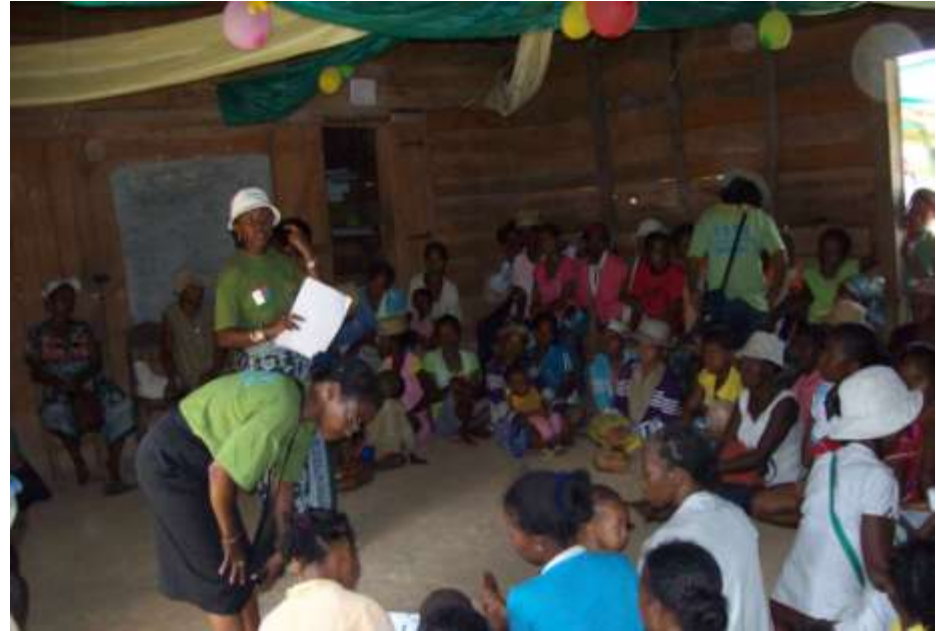
Community mobilization in the council on gender equality