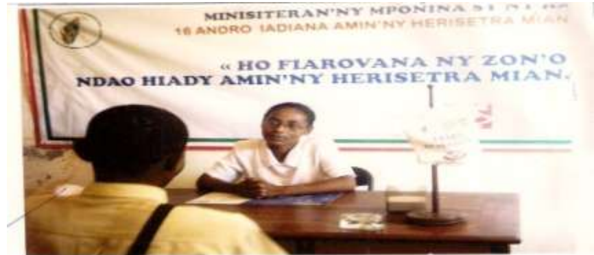
A man coming to the centre for complaining