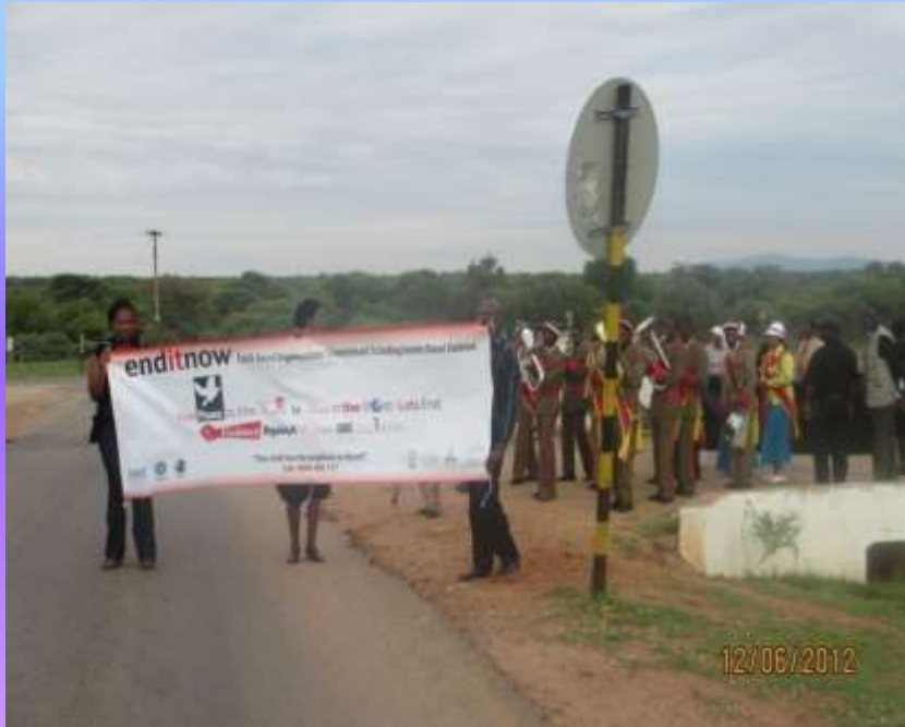
St Paul Brass band leading the march for the 2012 campaign

❖ Strengthened functional Ministers Fraternal Committees around the district