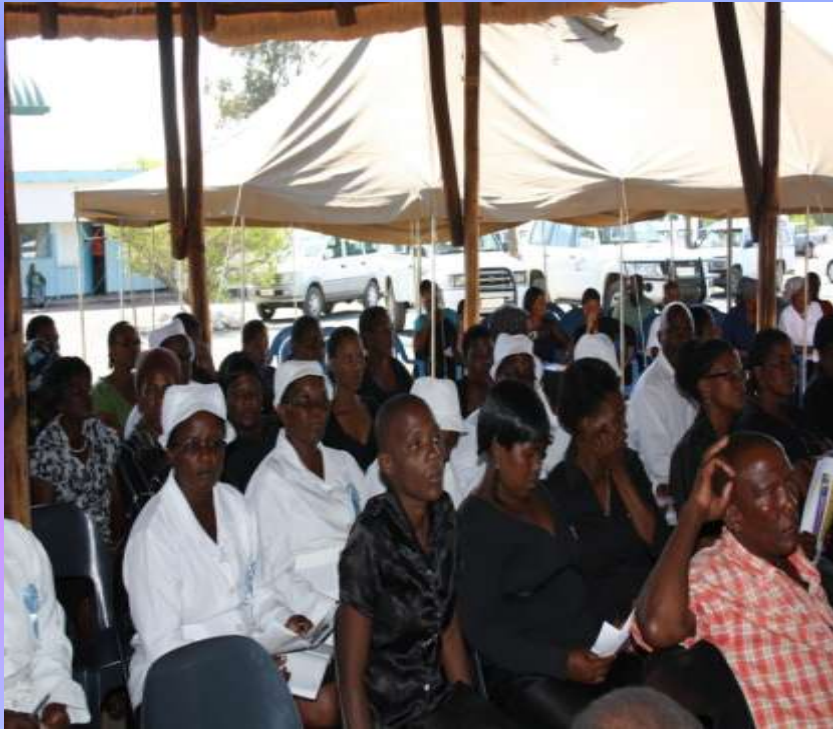
Church members attending the campaign