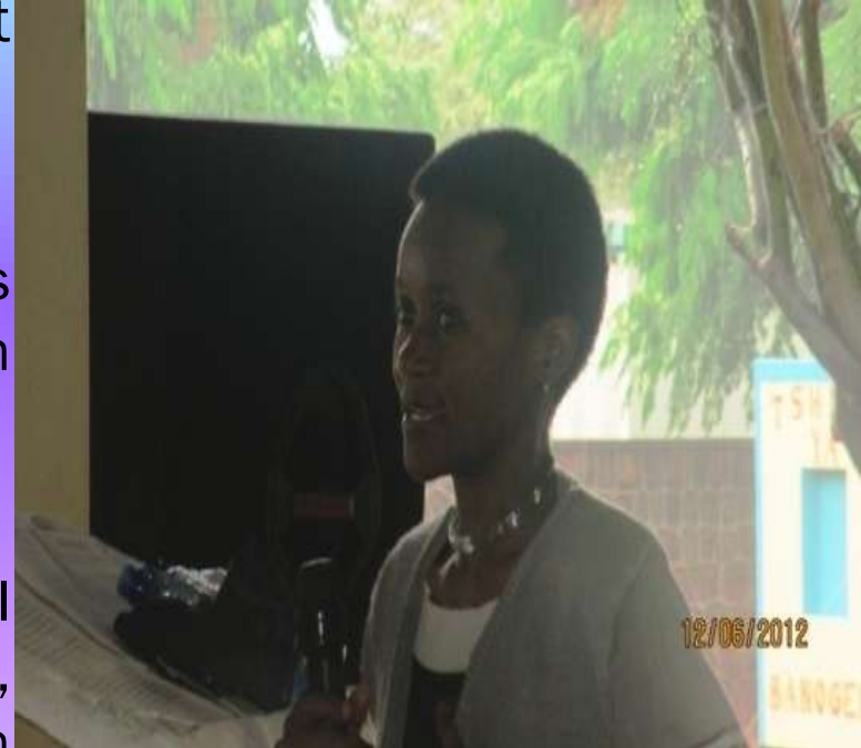
GBV survivors giving testimony & a motivation at the Thursdays' in Black activity

❖ victims and survivors of GBV, to indicate to them that society will fight for their deliverance