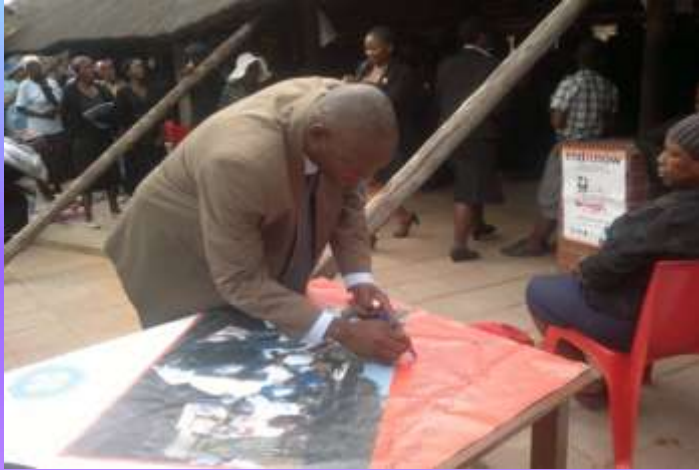
The then Vice Council Chairman committing to being an ambassadors in the fight against GBV