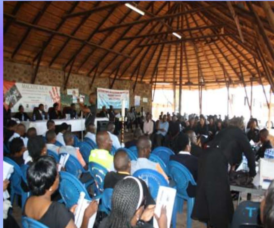
Participants at the launch of the Thursday's in Black initiative