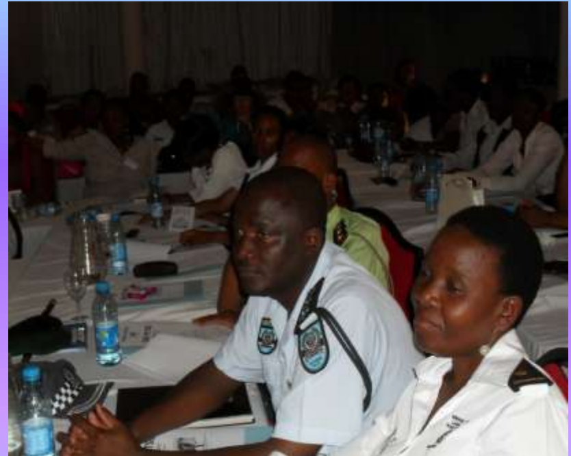
Participants at the consultative forum/Pitso