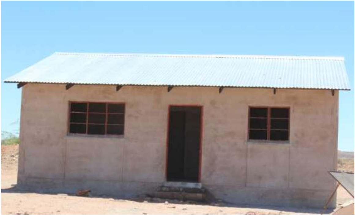
Figure 3 Aroab Social Housing under construction.