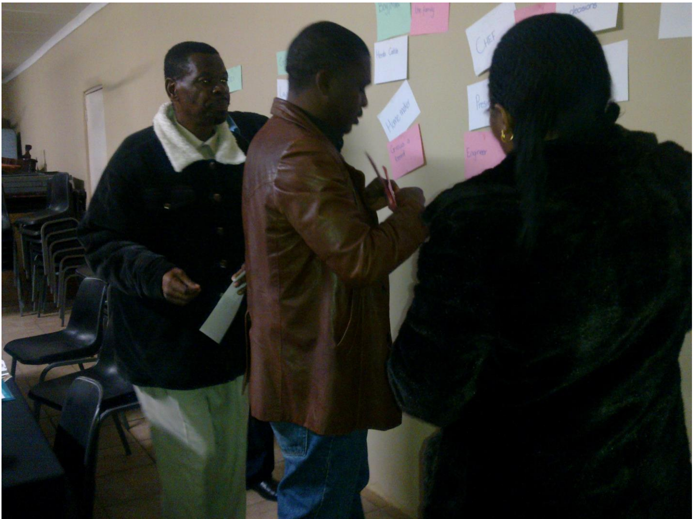
Lavumisa Town Board participants doing a card exercise during their stage 3 CEO workshop at Lavumisa Hotel

Dates: 26-28 July 2011 Venue: Lavumisa Hotel